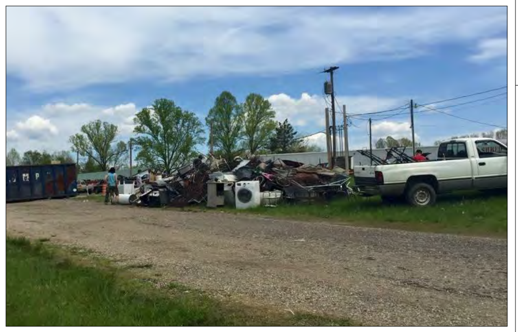
Scrap metal pile at the May 2, 2015 clean up day.

Funding and support provided by the Ohio Environmental Protection Agency, the Meigs Soil and Water Conservation District, Meigs County Health Department, the Meigs County Commissioners, Meigs County Grants Office, and the Gallia, Jackson, Meigs, Vinton Solid Waste District.